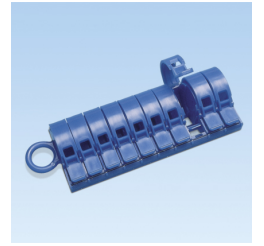
PM D EMPTY DISPENSER