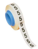
PM D R - *