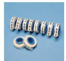
PM D R - * - *